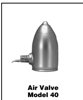
Air Valve Model 40