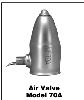
Air Valve Model 70A